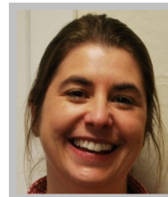
Mrs O'Sullivan Dance & Drama